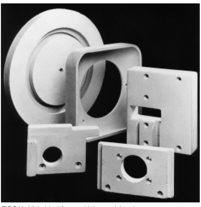
ZIRCAL-95 is ideal for machining to tight tolerances.

ZIRCAR Refractory Comoposites, Inc. provides a variety of non-asbestos calcium silicate structural insulations that combine high strength and excellent thermal insulating characteristics for use in a variety of heat processing, fire protection and electrical resistance applications. The unique calcium silicate structure provides excellent thermal shock resistance as evidenced in its typical use as a direct contact board for non-ferrous metals and in fire training burn rooms. They are fire resistant to temperatures approaching 2000°F. They also exhibit low thermal conductivities that remain relatively constant over a broad range of operating temperatures.