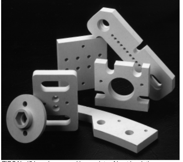
ZIRCAL-45 boards are used in a variety of heat insulating process, fire protection and as machined parts.